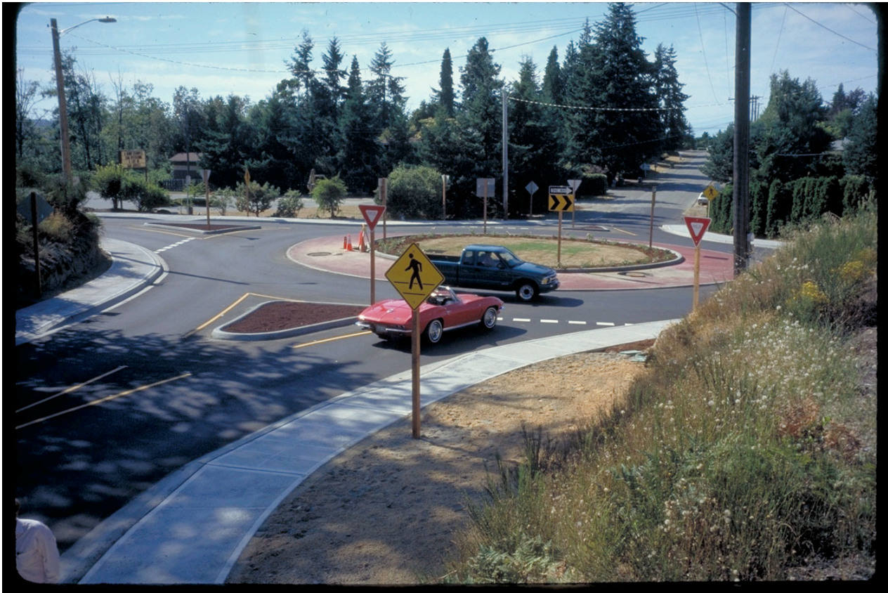
A typical modern roundabout in University Place, WA. At the roundabout entry, the clear width provided is only approximately 13 feet: this is an intentional design element to keep vehicle speeds low. Photo: IMG0032.jpg