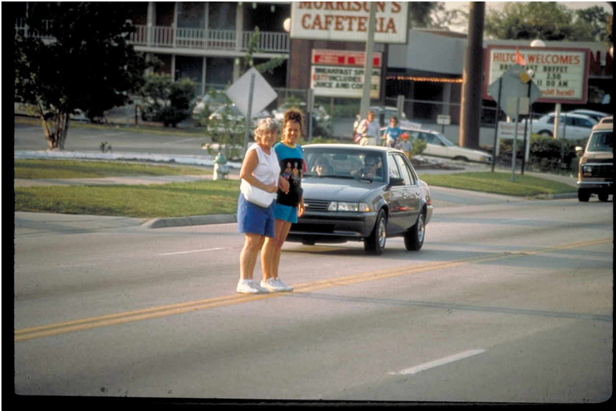
An example of an undivided roadway. Photo: IMG0064.jpg