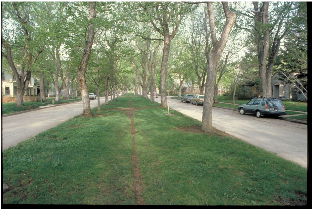
An example of a roadway with a raised median and approximately 17 feet of clear width on each side of the median. Photo: median.jpg