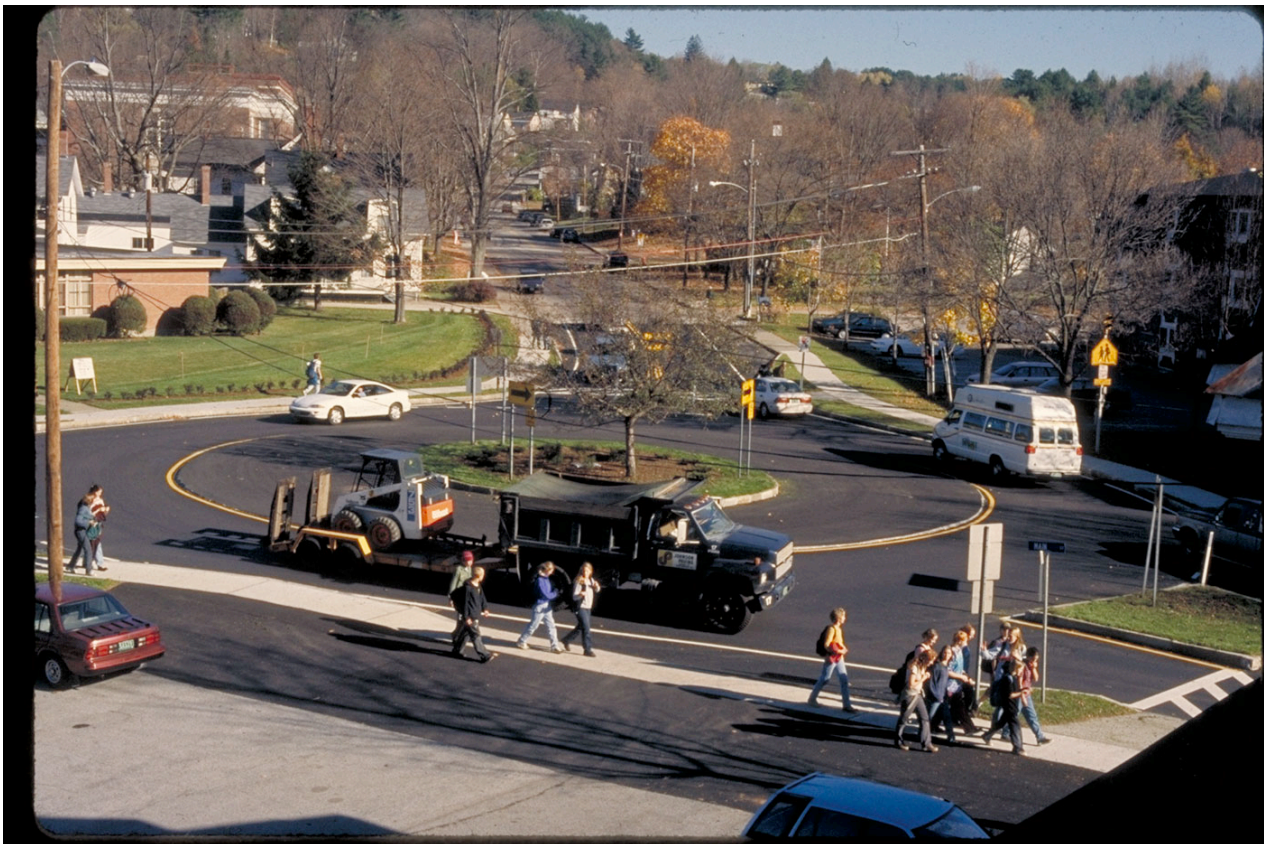
Another modern roundabout near a school in Montpelier, VT. Again, note that the entry widths are kept to no more than 13 feet, to ensure low speeds both at the pedestrian crosswalks and within the intersection. Photo: IMG0027.jpg